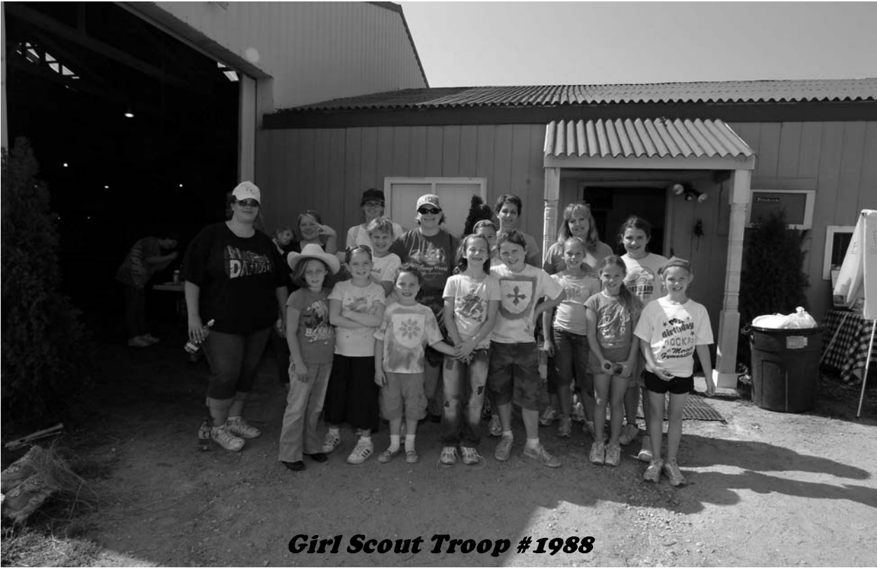
Girl Scout Troop #1988