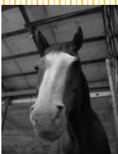
E. Big Joe

1. _____ This horse is the boss of the pasture. When rescued, his hind quarters were fly bitten and raw. He was terrified of people. Now, he is quirky and fun to ground train. A favorite of the volunteers.